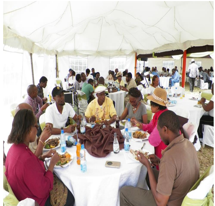
Members enjoying a meal during the members day