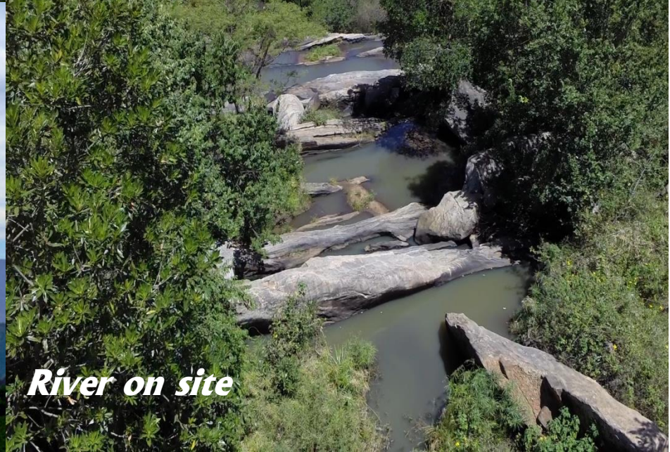
River on site