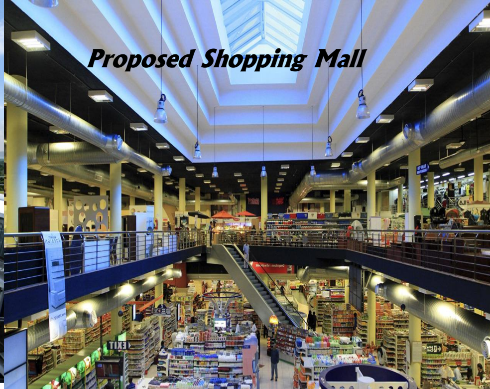
Proposed Shopping Mall